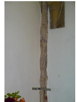
Internal cracks in South wall of the Chancel

We feel that St Michael's is in good hands with The Morton Partnership being highly respected for their work on historic buildings. Their expertise has led them to be involved in many high-profile projects such as the Albert Memorial as well as overseeing the magnificent new Tower added to the Cathedral in Bury St Edmunds. They have a long history of involvement with St Michaels.